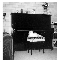
MY BELOVED PIANO

I lost the tinkly sounds of the high pitches first. I gave up teaching and slowly I stopped playing as all sound died. By the time I was 35 I was profoundly deaf and even with the help of a hearing aid I could no longer understand the tv, radio or movies and parties were hell. I had become isolated.